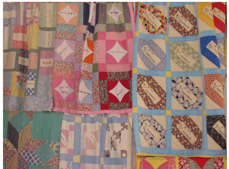
Many area Friendship quilts are displayed

The halls and foyer are decorated with early Winters town scenes and early members of the community. The upstairs rooms are dedicated to special displays. There is the Bridal Suite with its private bathroom, the veterans room, the "Lazy N Stable", a miniature horse establishment, an extensive display for native son, Rogers Hornsby, and, of course, a quilt room.