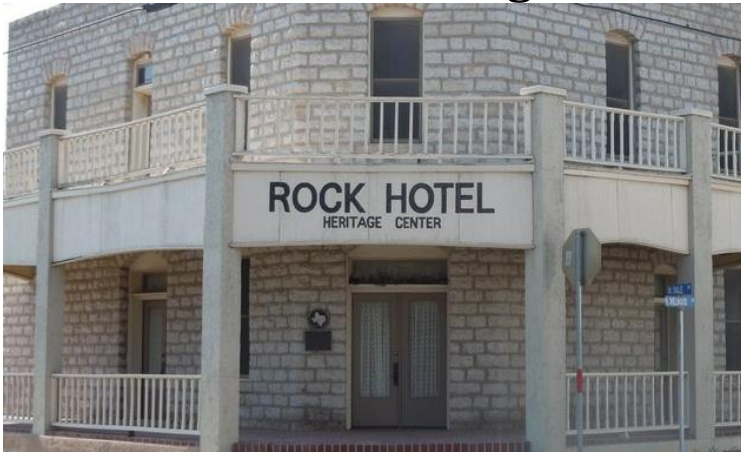
Rock Hotel constructed of local stone in 1909

Construction was completed at the same time as the Abilene & Southern Railroad started service. With the arrival of rail service to Winters the hotel was available to accommodate both inbound and out going passengers. Being just one block from the train depot it was handy for both passengers and traveling salesmen (see Drummer House).